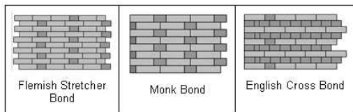
Learn the different types of brick bonds

If you have any queries, or own an old building which you would like to learn more about on its history, please get in touch with us.