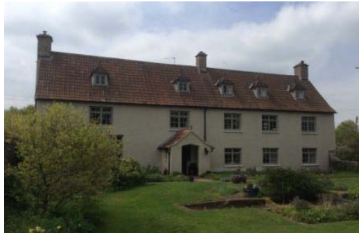
Looks can be deceiving; behind the stone front of Algars Manor are timbers dated to AD 1560s