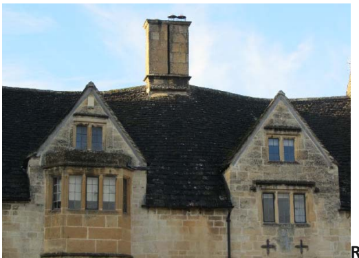
Recognise the difference between Jacobean (pictured) & Dutch gabled windows

Our free illustrated glossary on building features makes it easy to recognise key features to help understand buildings.