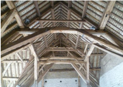
Siddington Tith Barn showing passing-braces characteristic of its early date of construction, tree-ring dated to AD 1247

Our on going recording & research helps identify what building features and types are common or rare in Gloucestershire. Also, we are starting to develop online photographic records and glossaries of period features and buildings for the County.