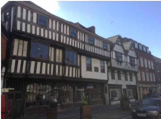
The Folk Museum in Gloucester. Learn to tell which half is the earlier building?

We have a unique wealth of old buildings in this country, but few people are able to really appreciate them.